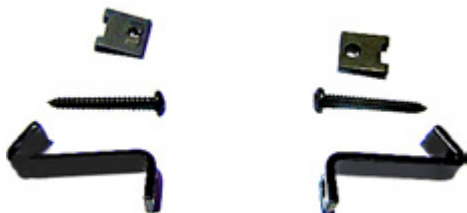
* Image of Hardware