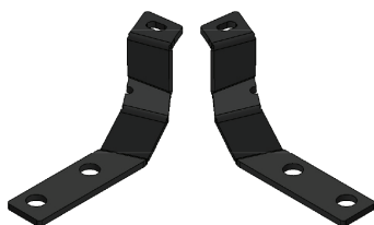
Mounting Brackets Only

* Simulated Rendering, NOT Actual Parts.